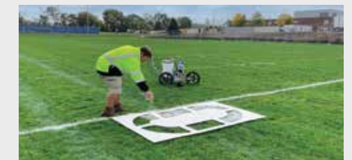
No-Tool Gun Removal for spraying stencils or large solid areas.