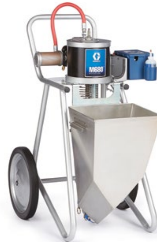
ToughTek M680a CS

The ToughTek M680a piston pump handles abrasive materials such as epoxy mortars, non-skid coatings (bridges and marine industry – solvent based coatings) or cementitious materials, and tackles difficult polymers with fillers such as glass flake, silica or sand. The all stainless design makes cleanup of epoxy mortars easy and worry-free.