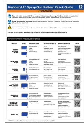
Spray Pattern Guide