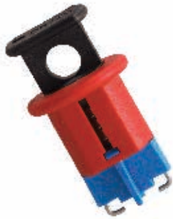
Pin In Standard Lockout (PIS)