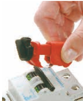
Pin Out Standard Lockout (POS)