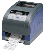
BBP®33 Label Printer (300 dpi)