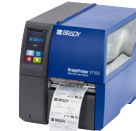
BradyPrinter i7100 (300 dpi) / (600 dpi)