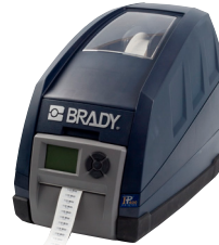
IP Printer (300 dpi) / (600 dpi)