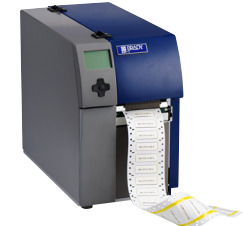
BBP®72 Printer (300 dpi)