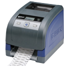
BBP ® 33 Label Printer (300 dpi)