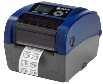
BBP®12 Label Printer (300 dpi)

Once you know which label material you need for your next design, the next step is finding the right printer to create quality labels on-demand. Brady has a variety of high-performance, reliable printers to choose from.