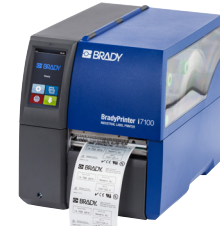
BradyPrinter i7100 (300 dpi) / (600 dpi)