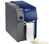
BBP ® 72 Printer (300 dpi)