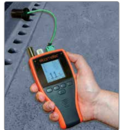
Easy to use with an intuitive menu structure

Connect the Elcometer 319 via Bluetooth® or USB to a PC, Android™ or iOS mobile device & download the data into an inspection application or into ElcoMaster® for instant report generation.