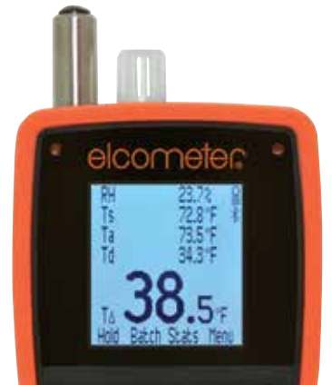
View up to 5 user selectable statistics on screen