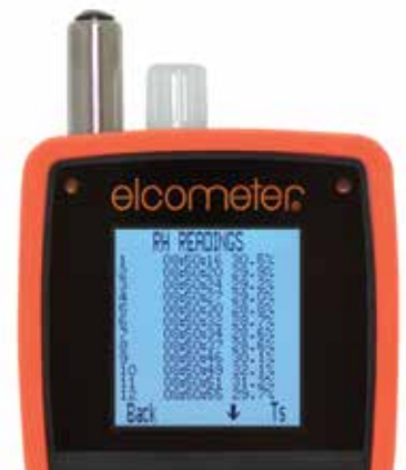
Review individual readings

The Elcometer 319 can be used as either a hand-held dewpoint meter or as a remote data logging monitor. 2