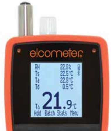
Large easy to read measurements in degrees °C or °F

BS 7079-B4, IMO MSC.215(82), IMO MSC.244(83), ISO 8502-4, US Navy NSI 009-32, US Navy PPI 63101-000