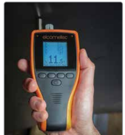
Dustproof and waterproof with fully sealed sensors