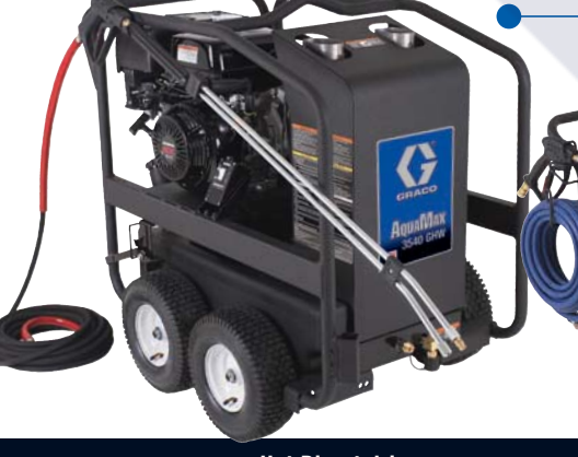
Hot Direct drive