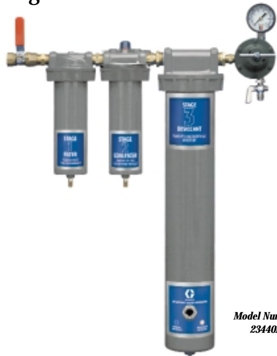
Model Number 234401