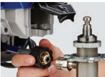
3) Remove hose and suction tube