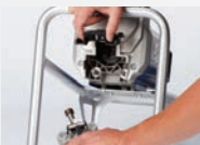
3) Remove pump