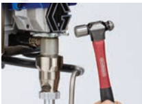
1) Loosen the clamping nut