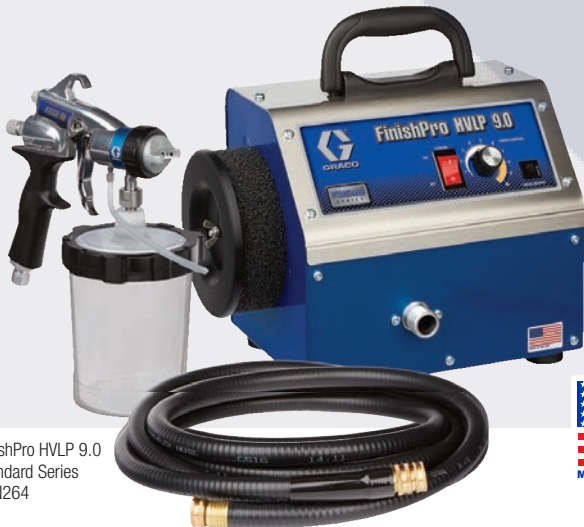
FinishPro HVLP 9.0 Standard Series 17N264