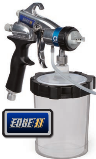
HVL P EDGE II Gun with FlexLiner — 17P481

Gain the competitive edge you need with the cutting-edge technology available only in the HVLP EDGE II and EDGE II PLUS guns.