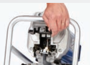
2) Unlatch and lift door