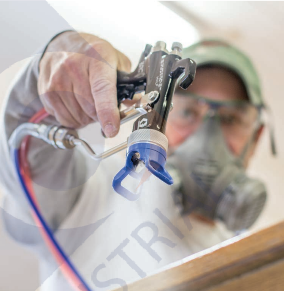
FinishPro II 395 PC Pro 17C417