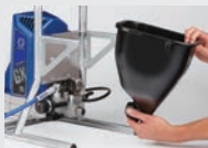
1) Remove hopper