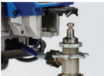
2) Open door and remove pump