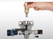
4) Replace cartridge