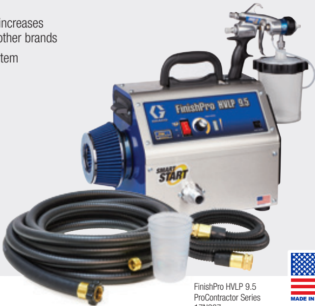
FinishPro HVLP 9.5 ProContractor Series 17N267

Ready to spray: complete with Edge II PLUS Spray gun, multiple Fluid Sets, and 30' Super-Flex Air Hose