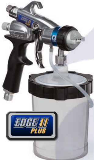
HVL P EDGE II Plus Gun with FlexLiner — 17P483