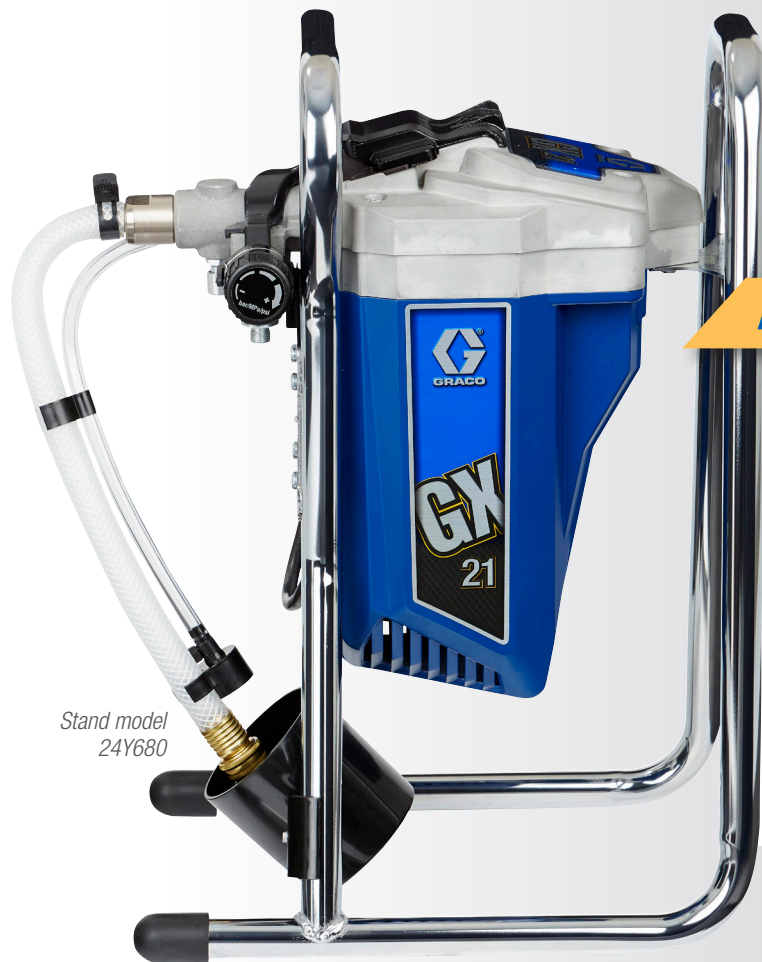
Stand model 24Y680