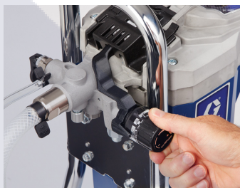
Adjustable Pressure Control

Patented power-piston pump for greater reliability and long life.