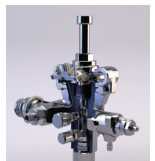
(ProX Piston Pump Shown)

Durable stainless steel piston pump delivers up to 3000 psi (207 bar) to spray the most challenging coatings