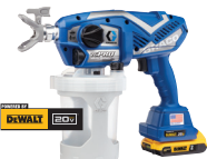
TC Pro Cordless