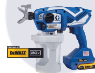
TC ProPLUS Cordless

Built for ultimate professional performance. The TC ProPLUS™ is the faster way to complete small jobs requiring the precision of a pro handheld, while the Pro210Es easily handles residential repaints, property maintenance, rental properties, and small commercial buildings.