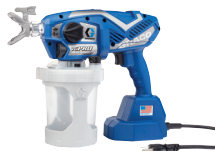
TC Pro Corded