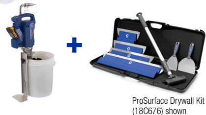
ProSurface Drywall Kit (18C676) shown

For More information visit graco.com/ProSurface