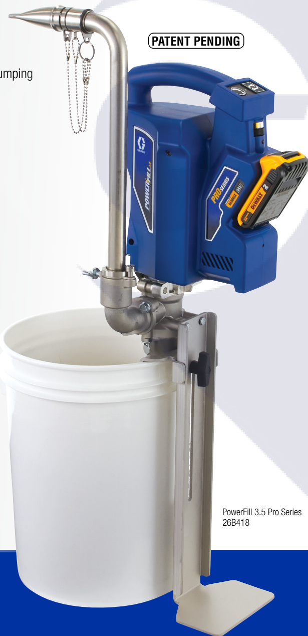
PowerFill 3.5 Pro Series 26B418