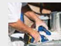
2) Remove the old pump from the sprayer