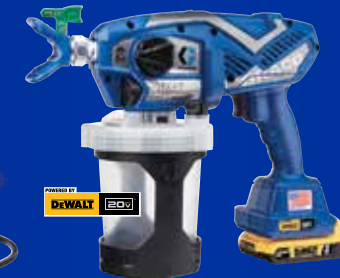
ULTRA CORDLESS AIRLESS HANDHELD