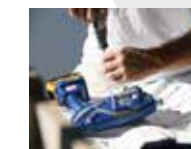
1) Remove the cover with a screwdriver