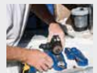
3) Place new pump into sprayer