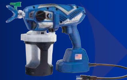
ULTRA CORDED AIRLESS HANDHELD