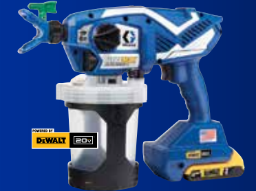
ULTRAMAX CORDLESS AIRLESS HANDHELD

SPRAYS WATER AND MINERAL SPIRITS-BASED MATERIALS ONLY (NO FLAMMABLE MATERIALS)