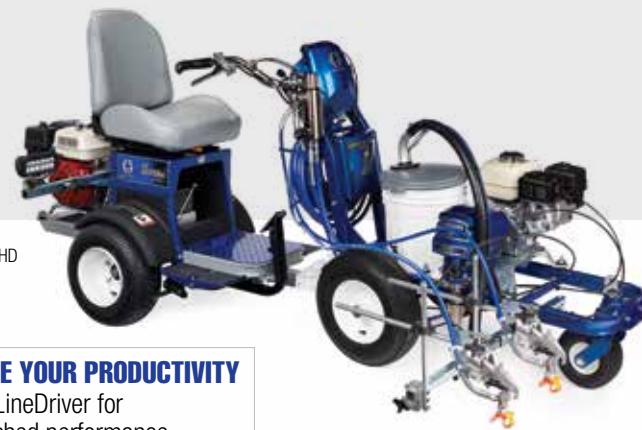
LineDriver HD 262005