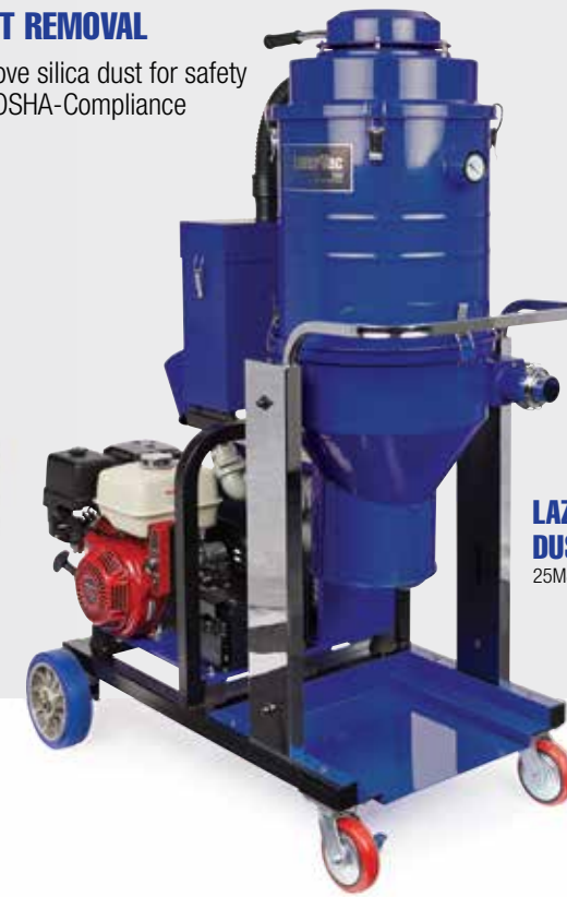
LAZERVAC™ 550 DUST COLLECTOR 25M860

Remove silica dust for safety and OSHA-Compliance