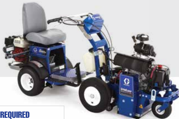
LineDriver HD 262005