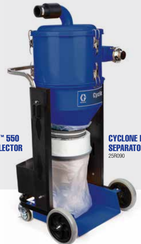
CYCLONE LP SEPARATOR 25R090