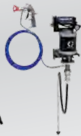
30:1 airless wall mount