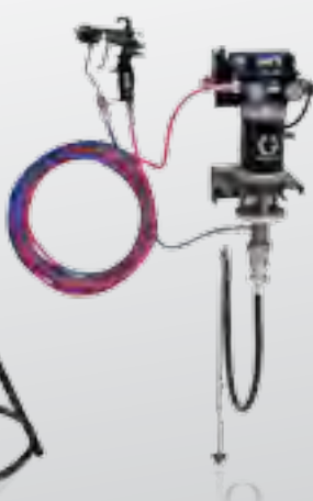
15:1 air-assist wall mount