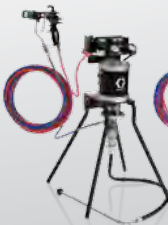
30:1 air-assist stand mount