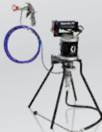
30:1 airless stand mount