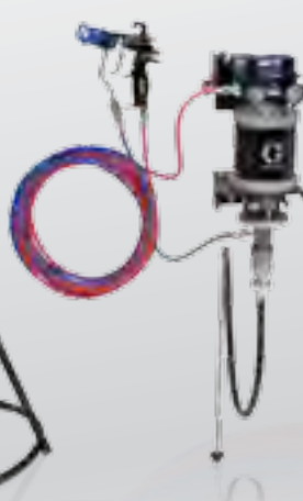
30:1 air-assist wall mount