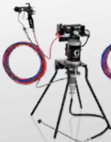
15:1 air-assist stand mount