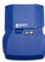
BMP®53 Label Maker See page 148