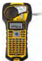
BMP®21-PLUS Label Printer See page 142