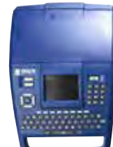
BMP®71 Label Printer See page 162