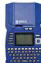
BMP®51 Label Maker See page 148