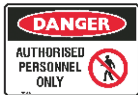
V DANGER AUTHORIZED PERSONNEL ONLY

Signs built to withstand extreme washdown environments to improve safety and productivity through visual communication. In food processing environments, you have a dedication to maintaining food safety while helping your employees stay safe on the job. With ToughWash® approved Plastic Encapsulated Signs, you can now warn employees of hazard, identify equipment and provide work instructions where you previously could not.