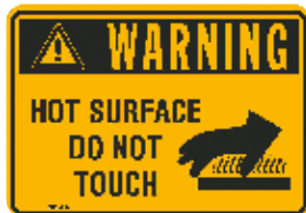
V WARNING HOT SURFACE DO NOT TOUCH