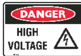
V DANGER HIGH VOLTAGE