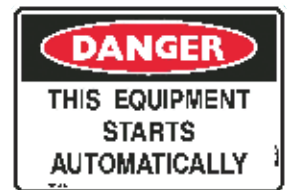
V DANGER THIS EQUIPMENT STARTS AUTOMATICALLY