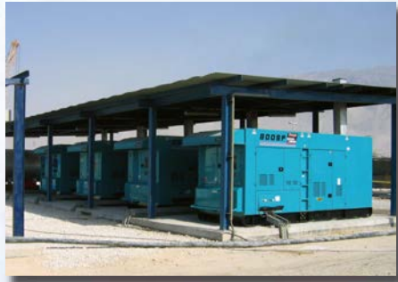
As the power source in the areawhere electricity is unavaible.