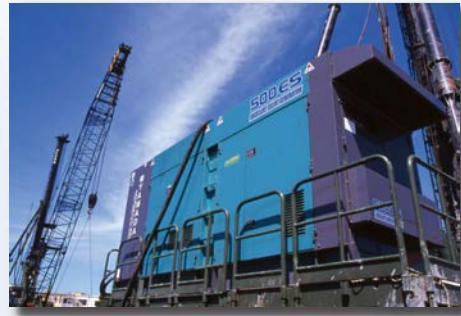
As the power source in the construction site.