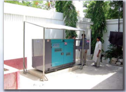
As the Emergency power source in the hospital.