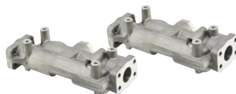
CFLS Dual Filter Heads P568583, P574958