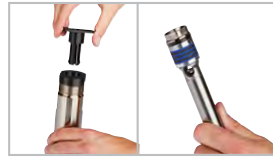
2) Remove disposable clip