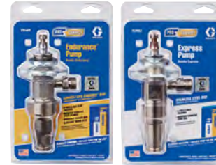
For sprayers older than 2014, reference PartsBook at gracopartsbook.com

Replace the pump yourself in less than a minute and without any tools. Pumps available for all Graco sprayers, from small to large.