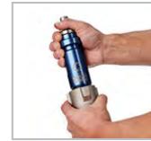
3) Assemble pump