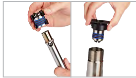
1) Insert pre-oiled packing cartridge assembly