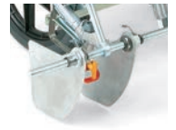
FieldLazer S100 Adjustable Spray Shield