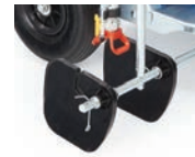
FieldLazer S90 Adjustable Spray Shield