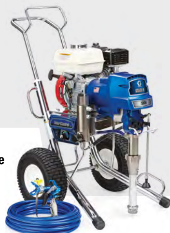
GMAX II 5900 Standard 17E831