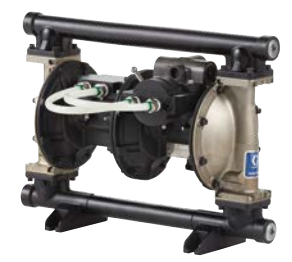
Husky 1050HP 1 in (25.4 mm) connection Max flow: 50 gpm (189 lpm) Aluminum and stainless steel