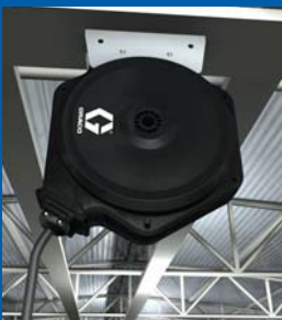
Ceiling/Wall Stationary Mount (optional)