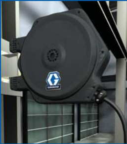
Ceiling/Wall Swivel Mount (standard)

Quality hose reels mount in minutes—gives you years of worry-free performance!