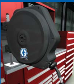
Bench Mount (optional)