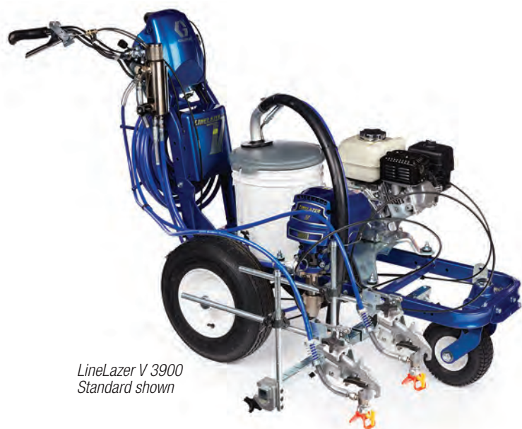
LineLazer V 3900 Standard shown

When it's time for 1- or 2-gun airless line striping, the LineLazer V 3900/5900 Standard Series strippers are an excellent choice. These durable striping machines deliver consistent lines for all your basic striping needs.