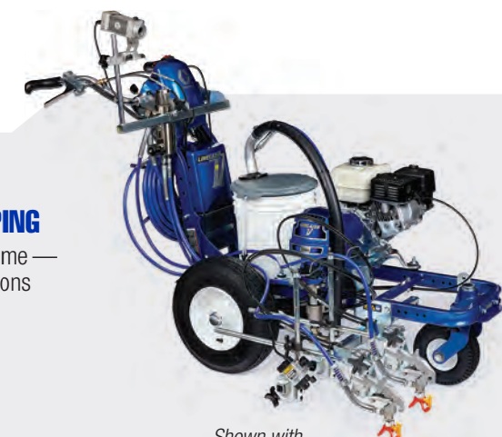
Shown with LazerGuide 2000