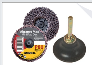
Abranet Max flap disc & adapter 50 mm / Grits 40-120