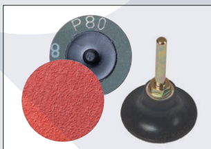
Other Quick Lock discs 50 mm / Grits 36-120