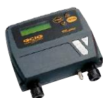
TANK LEVEL INDICATOR