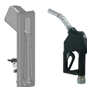
NOZZLE SWITCH WITH A60