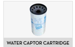
WATER CAPTOR CARTRIDGE