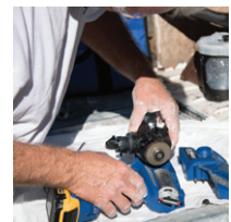
3. Place new pump into sprayer.