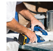
2. Remove the old pump from the sprayer.