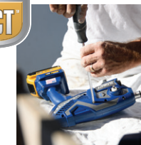
1. Remove the cover with a screw driver.