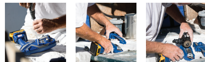
1. Remove the cover with a screw driver. 2. Remove the old pump from the sprayer. 3. Place new pump into sprayer.