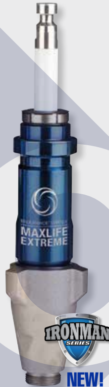
Endurance Vortex MaxLife Extreme Pump for GMAX Extends pump rod life by 3X — delivering the industry's lowest cost of ownership