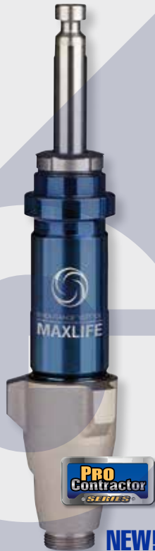
Endurance Vortex MaxLife Pump for GMAX 6X longer between repacks