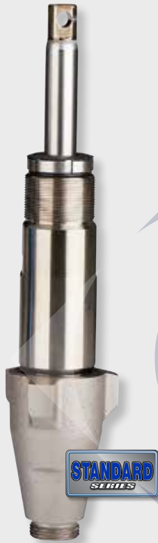
Endurance Chromex™ Pump for GMAX Lasts 2X longer than competing pumps