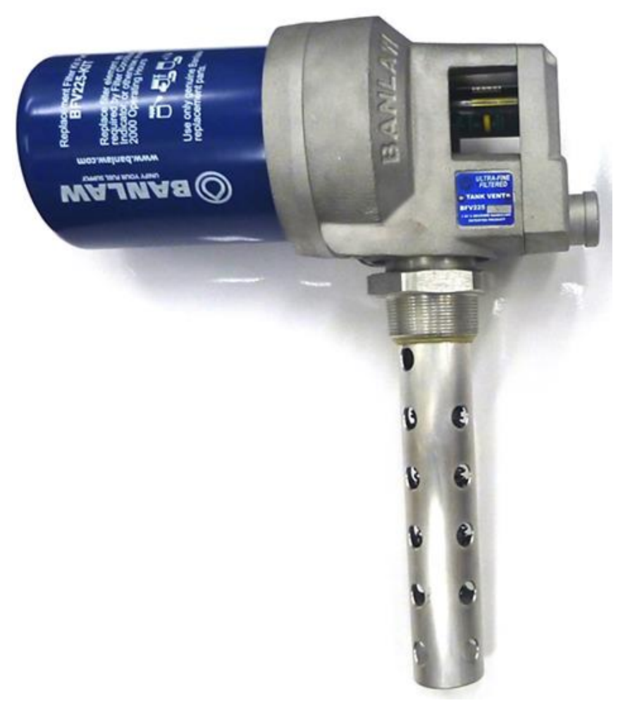
Figure 1 - BFV225A Tank Vent

Thankyou for purchasing this high quality Banlaw product. Please read through and understand the information in this Product Data Sheet BEFORE installation or operation of the product to avoid potential health safety & environment (HS&E) risks or property damage.