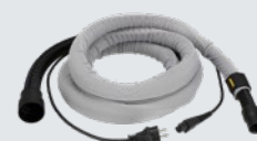
Sleeve for cable & hose 3,8 m: MIE6515911 or 5,8 m: MIE6515921 or 9,8 m long: MIE6515931