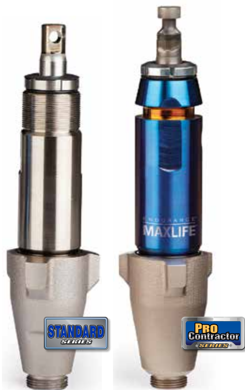
Endurance Chromex Pump for GH

Follow the registration instructions included with your sprayer.