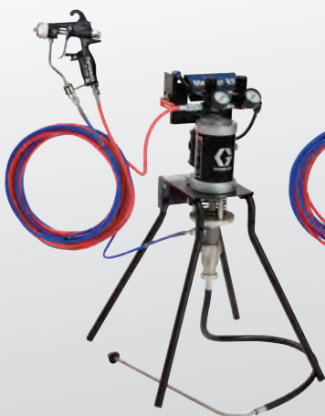
15:1 air-assist stand mount