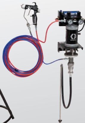
15:1 air-assist wall mount