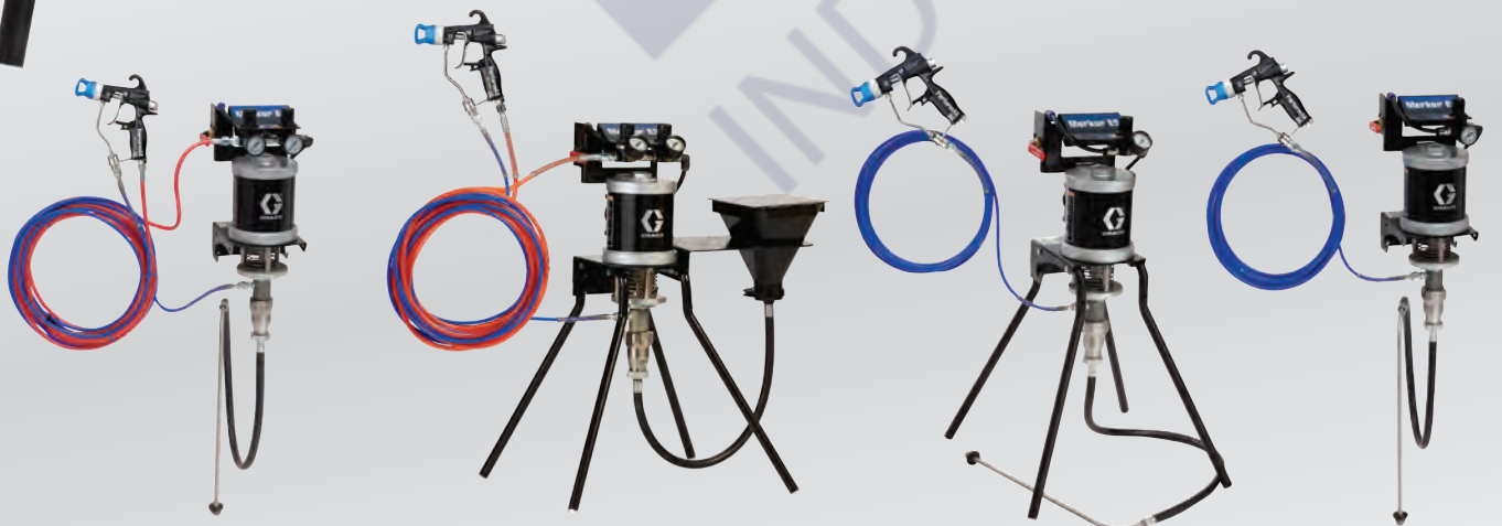
30:1 air-assist wall mount