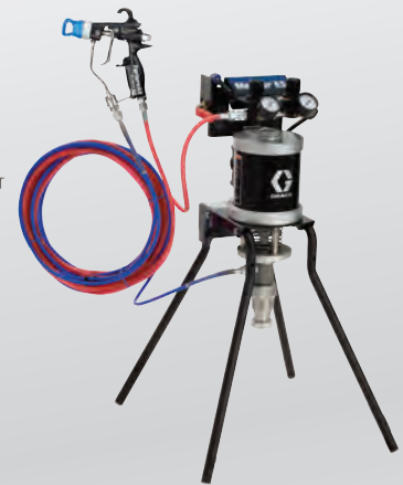
30:1 air-assist stand mount