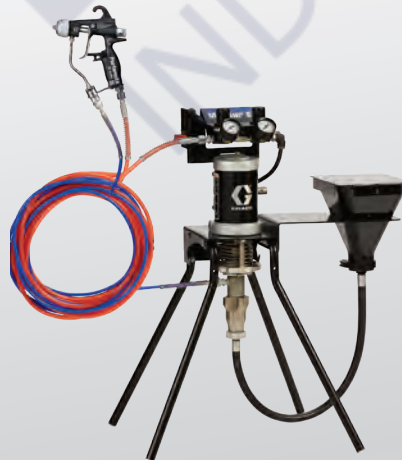
15:1 air-assist stand mount with hopper