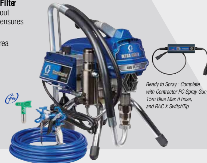
Ready to Spray: Complete with Contractor PC Spray Gun, 15m Blue Max™ II hose, and RAC X SwitchTip™