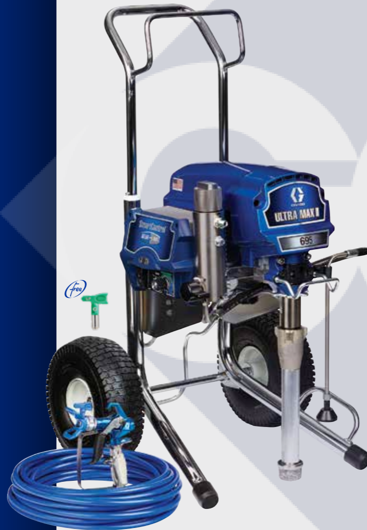
Ready to Spray: Complete with Contractor PC Spray Gun, 50 ft Blue Max II hose, and RAC X SwitchTip