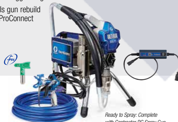
Ready to Spray: Complete with Contractor PC Spray Gun, 15m Blue Max™ II hose, and RAC X SwitchTip™