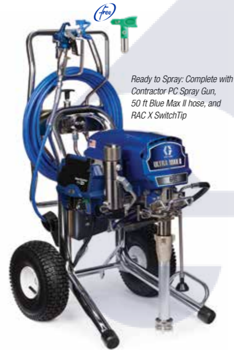
Ready to Spray: Complete with Contractor PC Spray Gun, 50 ft Blue Max II hose, and RAC X SwitchTip