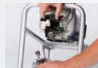
3) Remove pump