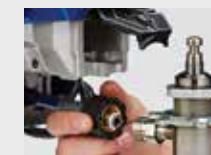
3) Remove hose and suction tube