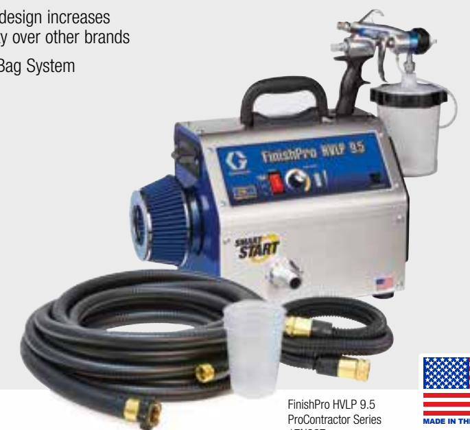
FinishPro HVLP 9.5 ProContractor Series 17N267

Ready to spray: complete with Edge II PLUS Spray gun, multiple Fluid Sets, and 30' Super-Flex Air Hose