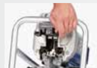
2) Unlatch and lift door