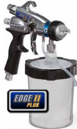
HVLPE EDGE II Plus Gun with FlexLiner — 17P483