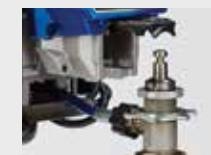
2) Open door and remove pump