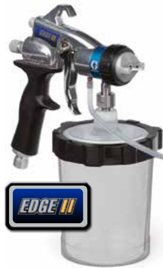
HVLPE EDGE II Gun with FlexLiner — 17P481

Gain the competitive edge you need with the cutting-edge technology available only in the HVLP EDGE II and EDGE II PLUS guns.