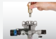
4) Replace cartridge