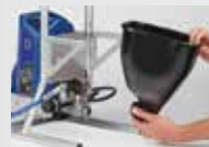
1) Remove hopper