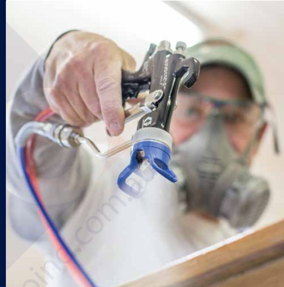
FinishPro II 395 PC Pro 17C417

ONBOARD AIR COMPRESSOR with SmartComp delivers a superior finish