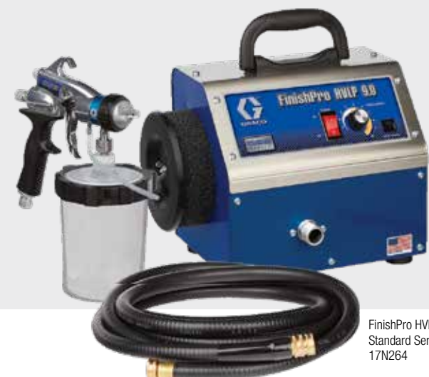
FinishPro HVLP 9.0 Standard Series 17N264

Ready to spray: complete with Edge II Spray gun, #3 Fluid Set, and 20' Super-Flex Air Hose