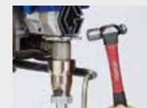
1) Loosen the clamping nut