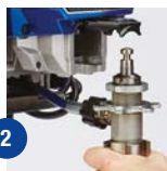
2 Open door and remove pump