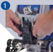
Slide open the access door