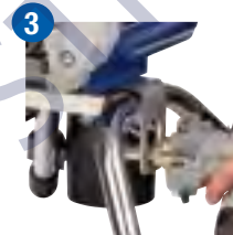
Use frame to remove cartridge