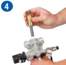
Install new cartridge and replace pump