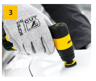
Lightly press with the sander and sand for 2–3 seconds.