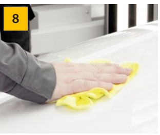
Use Mirka soft micro fibre cloth for final cleaning.