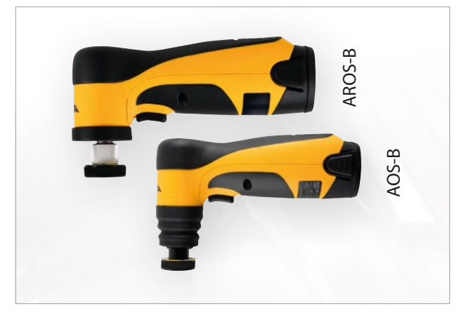
Mirka® AOS-B and AROS-B Sanders