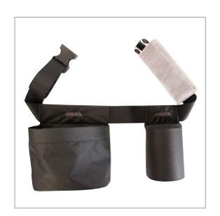
Mirka Multi-purpose belt