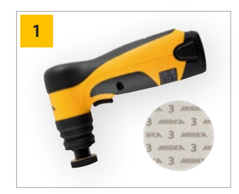
For removing of defect use Novastar® SR and Mirka® AOS-B 130NV sander.