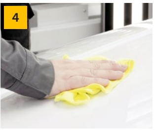
Wipe clean and check the surface. Repeat step 3 if needed. Use Mirka soft micro fibre cloth.