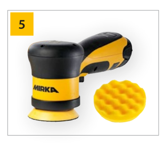
For polishing and finalising use the cordless Mirka® AROP-B 312NV polisher, Mirka® Yellow waffle pad and Polarshine® 12.