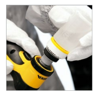
Damper with detergent or water