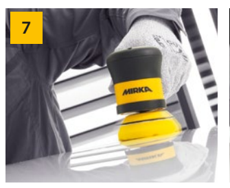
Polish by gently pressing. Use at moderate speed. Wipe clean and check the surface. Repeat if necessary.