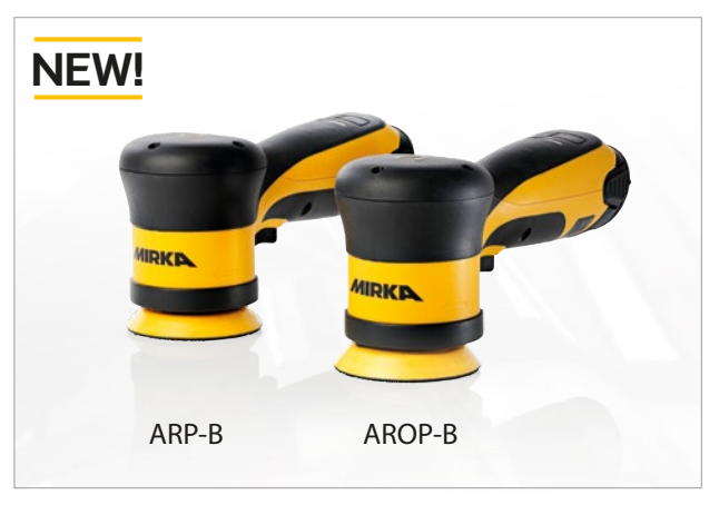
Mirka® ARP-B and AROP-B Polishers