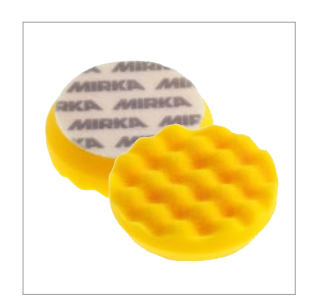
Mirka foam pad, yellow waffle