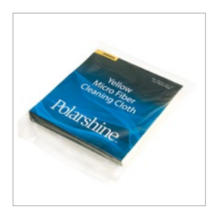
Yellow microfiber cleaning cloth