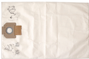
ACCESSORY ITEM* DE-FDB Fleece Dust Bag for DE-1230