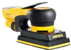
MID3530201US 3" x 5" Mirka® DEOS Vacuum-Ready electric Sander, 3.0 mm orbit