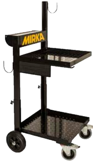
9190310111 Mirka Trolley Cart