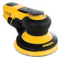
MRP-550CV 5 mm Orbit 5" (PROS) Pneumatic R/O Sander