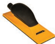
MVHB38 Yellow Grip Faced Multi-Hole Vac. Block (70 mm x 198 mm)