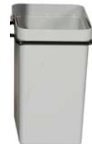
ACCESSORY ITEM* 9190186001 Waste Bin and Rack for Mirka Smart Cart