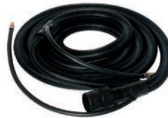
MV-412HA Hose 1½" x 15' with Integrated air hose