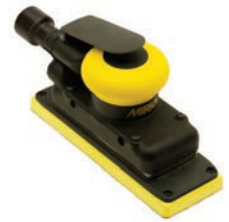
MR-38CV-1 2 3/4" x 7 3/4" Vacuum-Ready Orbital Sander with 3 mm Orbit