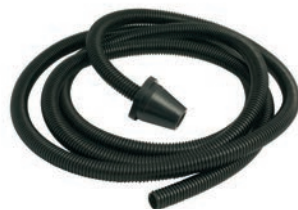
ACCESSORY ITEM* 9110-A Exhaust Hose For Vacuum Blocks & Connector Air Inlet