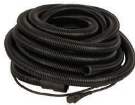
MVHA-10 Vacuum Hose with Electrical Coaxial 1" x 33'