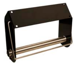
ACCESSORY ITEM* CART-HTRACK Hand Towel Rack For Smart Cart