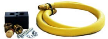
MAI-CART-AUXAIR Auxiliary Air Supply Kit for Smart Cart