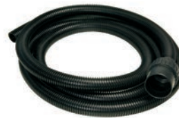
ACCESSORY ITEM* MIN6519411 Vacuum Hose & Adapter