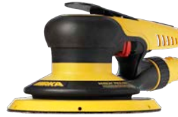
MRP-650CV 5 mm Orbit 6" (PROS) Pneumatic R/O Sander