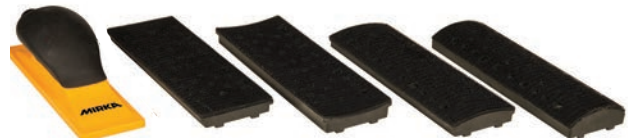
MVHB38-KIT Grip Faced With 4 Changeable Attachments (Convex, Concave, Slightly Concave And Flat) Multi-Hole Vac. Block