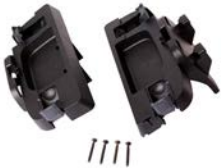
DE-TCFS Tool Case Fastening System For Mirka Tool Case Required for Workstation Fastening System