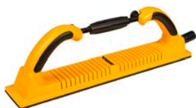
9116F Flexible Grip Faced Multi-Hole Vac. Block 2 3/4" x 16 1/2"