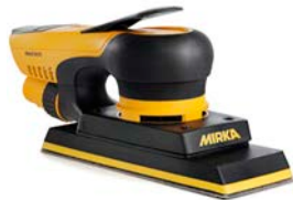
MID3830201US 2 3/4" x 7 3/4" Mirka® DEOS Vacuum- Ready electric Sander, 3.0 mm orbit