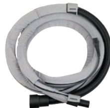
ACCESSORY ITEM* MIE6515911 Sleeve for Hose and Cable