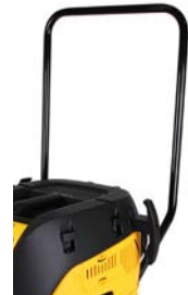
DE-HANDLE Handle extension for DE-1230-PC