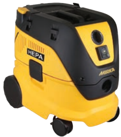
DE-1230-PC Dust Extractor - HEPA