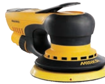
MID55020CAUS 5" Vacuum-Ready Electric Sander (5 mm Orbit) with case Also available in 3"