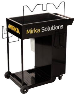
MAI-CART-912 Mirka Smart Cart