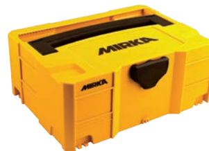
ACCESSORY ITEM* MIN6532011 Mirka Case T-LOC