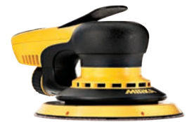
MID65020CAUS 6" Vacuum-Ready Electric Sander (5 mm Orbit) with case