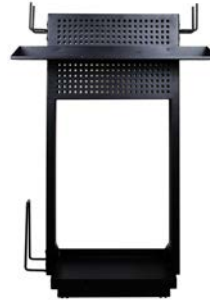
DE-WS Workstation for DE-1230-PC Must be used with DE-TCFS