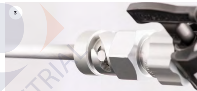
3 One more twist and it will be home