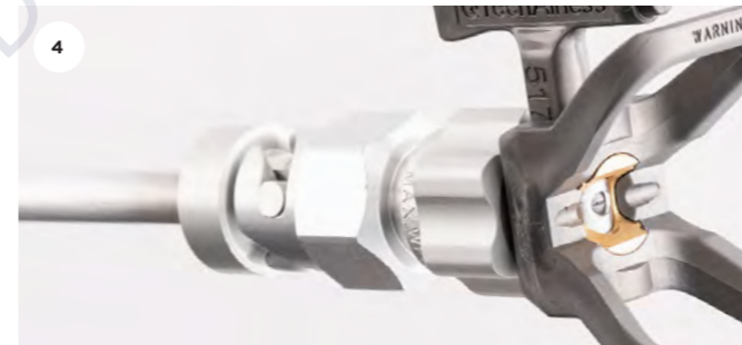
4 Ready to go, tip and guard fitted onto QuickConnect ® extension - no tools required

Ask your local decorators merchant about QTech QuickConnect ®