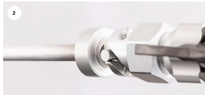
2 Tip and guard with adapter fitting onto QuickConnect ® extension